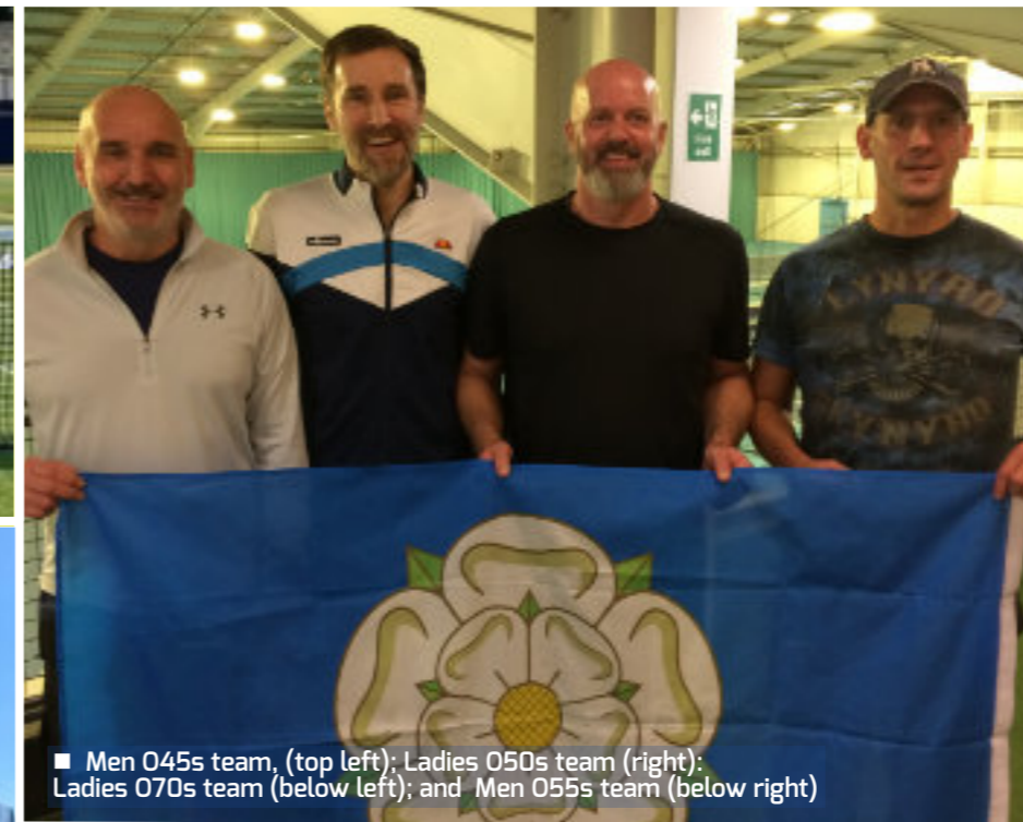
■ Men O45s team, (top left); Ladies O50s team (right); Ladies O70s team (below left); and Men O55s team (below right)