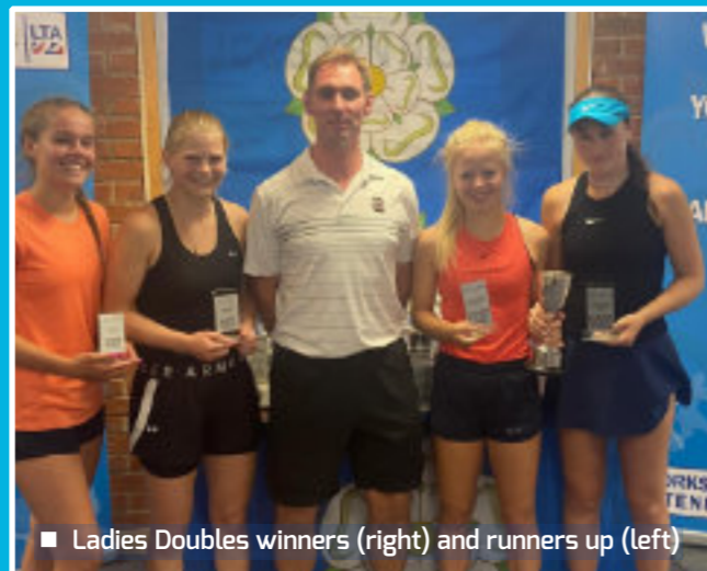
■ Ladies Doubles winners (right) and runners up (left)