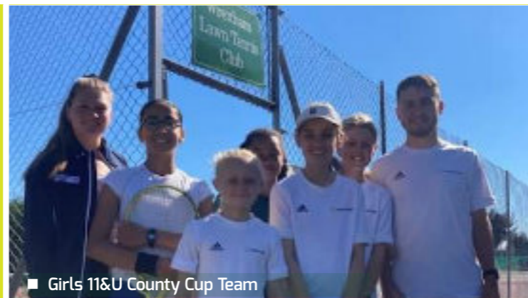
■ Girls 11&U County Cup Team