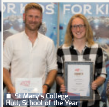
■ St Mary's College, Hull, School of the Year