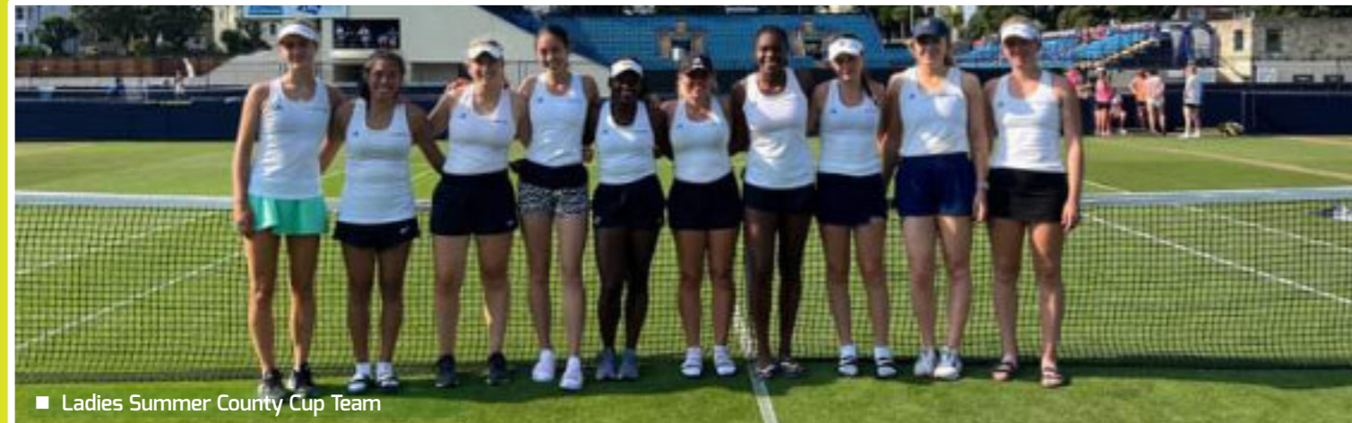
■ Ladies Summer County Cup Team