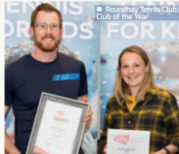
■ Roundhay Tennis Club, Club of the Year