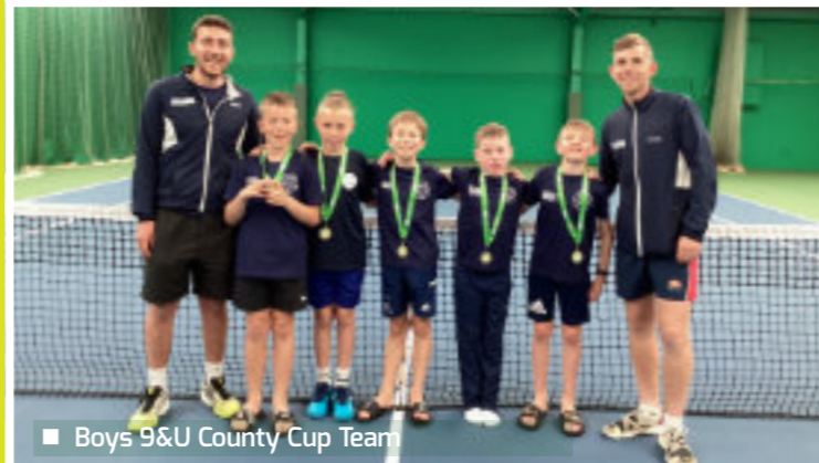
■ Boys 9&U County Cup Team