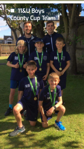
■ 11&U Boys County Cup Team