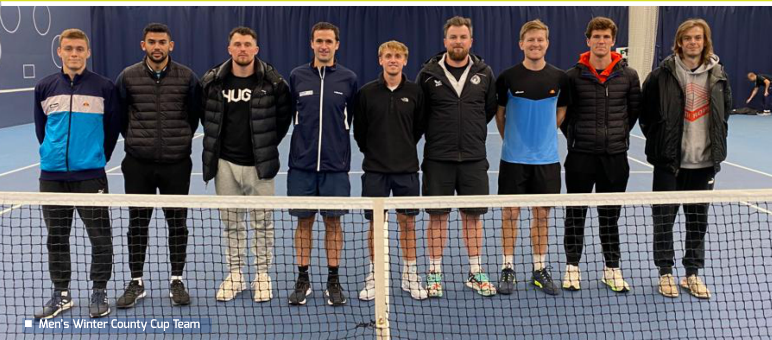
■ Men's Winter County Cup Team