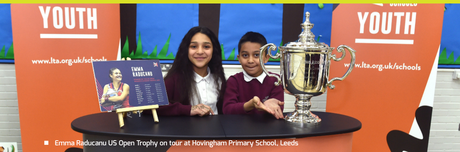
■ Emma Raducanu US Open Trophy on tour at Hovingham Primary School, Leeds