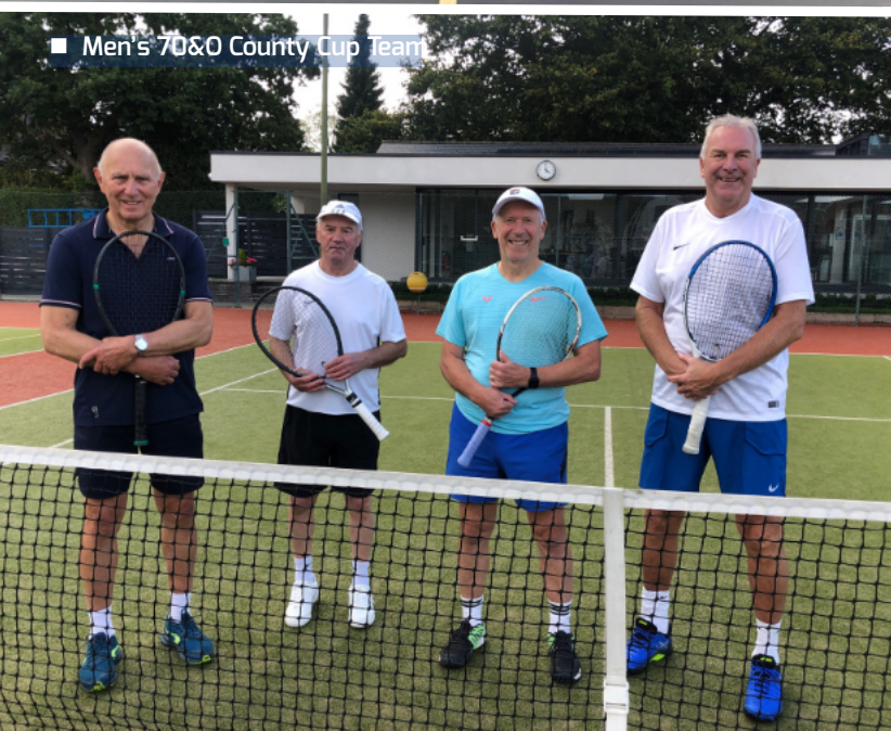
■ Men's 70&0 County Cup Team