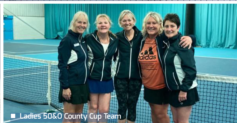
■ Ladies 50&0 County Cup Team