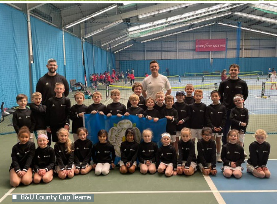
■ 8&U County Cup Teams