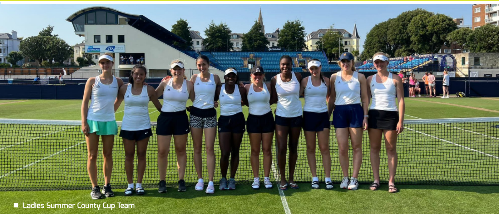
■ Ladies Summer County Cup Team