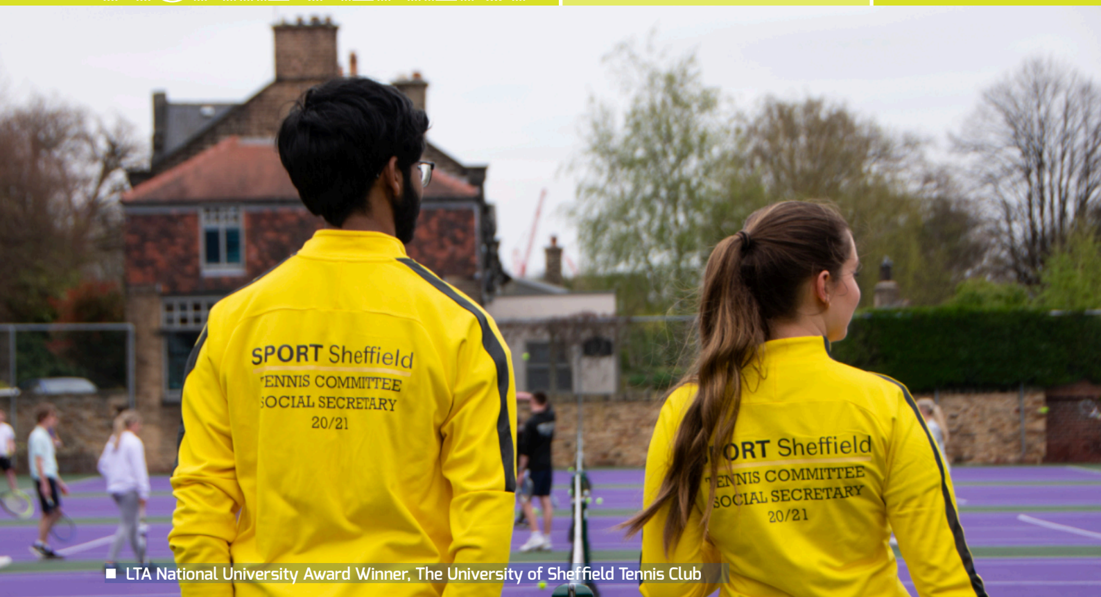
■ LTA National University Award Winner, The University of Sheffield Tennis Club