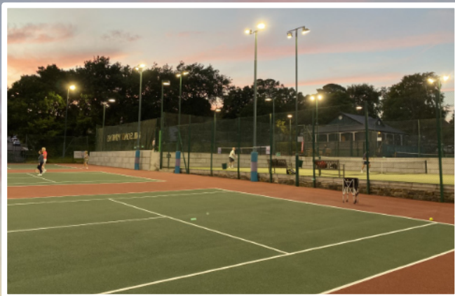
■ Fullwood LTC, Sheffield

would like to see improved links to clubs.