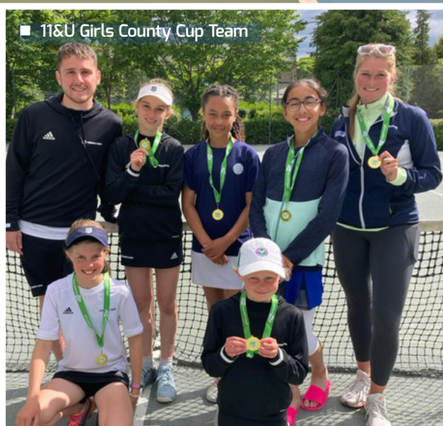
■ 11&U Girls County Cup Team