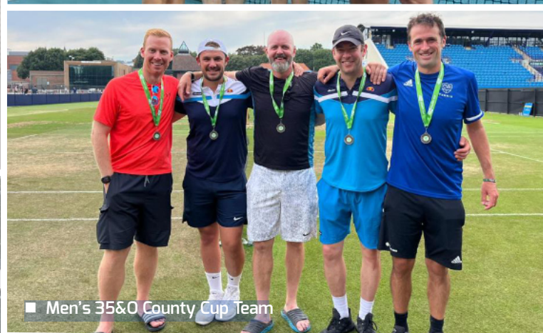
■ Men's 35&0 County Cup Team