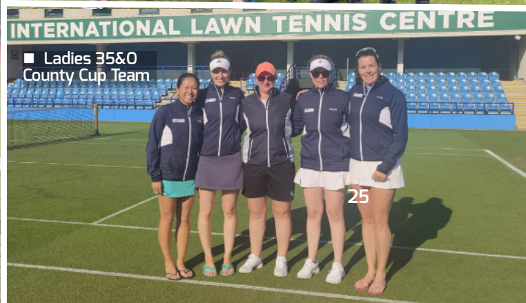
■ Ladies 35&0 County Cup Team