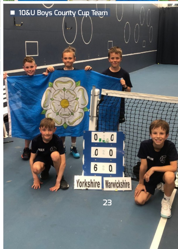
■ 10&U Boys County Cup Team