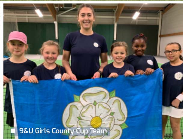
■ 9&U Girls County Cup Team