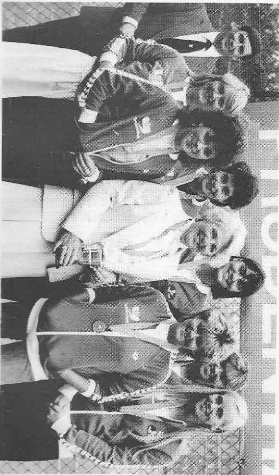
YORKSHIRE LADIES' JUNIOR COUNTY TEAM