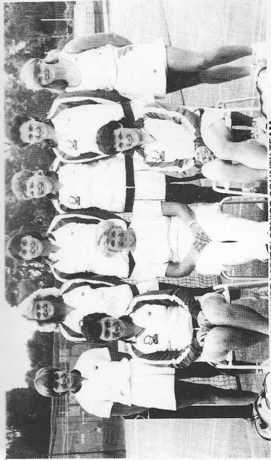
YORKSHIRE LADIES' SENIOR COUNTY TEAM